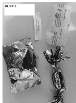
Alexandra Croitoru , Paris: A Photobook , 3 volumes, 26,5x20cm each, single copies, 2016