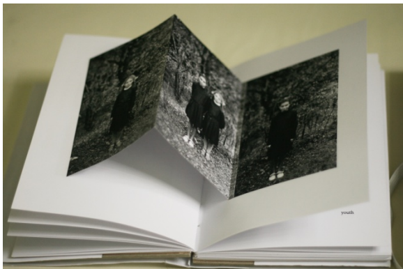
Tatiana Fiodorova, Bessarabia and its Inhabitants , Photobook, black and white, inkjet, 64 photo pages; 12 photographs made by Lefter Vasilii, black and white, 9 x 14 cm, 2016

The project Bessarabia and its Inhabitants continues Tatiana Fiodorova's research into the Bessarabian-Soviet past via the photo archive created by Vasilii Lefter, the artist's father. The book is based on archival materials and images of the villagers through which Fiodorova analyses, in an artistic way, the role of the peasants in the Soviet and post-Soviet context. The peasants are shown in the background of nature from their infancy to adulthood. On the one hand this cycle is repeated – on the other hand, sometimes there are failures, errors and losses. The unstable character of this archive stems from the represented subject – today, a historically charged fiction. Fiodorova records the traces of the slow process by means of which social reality turns into collective memory. In the context of the present day, the traditional concept of the peasant is blurred now; the majority of those who were peasants have become city dwellers or migrant workers. In both cases, the village is profoundly redefined through its symbolic displacement. According to the latest report by the Centre for State Information Resources, 50 villages in Moldova have effectively disappeared, left with fewer than 40 inhabitants. Villages in Moldova are dying in this way due to lack of employment and migration to urban areas and abroad.